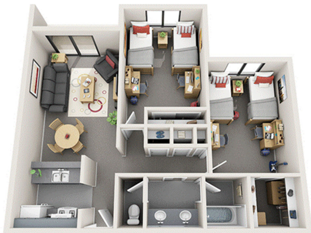
TROY EAST TYPICAL 2 BEDROOM APT PLAN