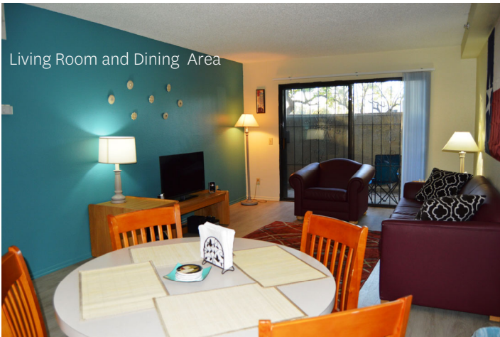
Living Room and Dining Area