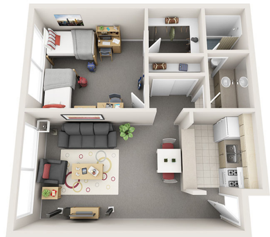
TROY EAST TYPICAL 1 BEDROOM APT PLAN

More information, including links to all the services offered by USC Auxiliary Services can be found on our website at housing.usc.edu